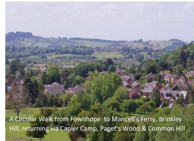
A Circular Walk from Fownhope to Mancell's Ferry, Brinkley Hill, returning via Capler Camp, Paget's Wood & Common Hill