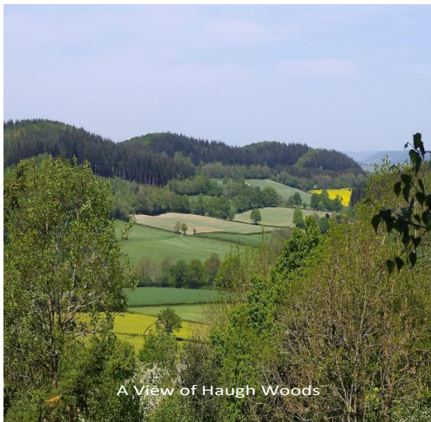
A View of Haugh Woods